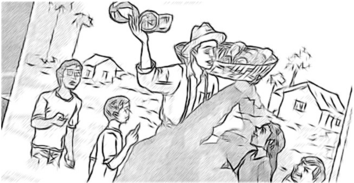
Using pictures to practise English.

Using Case Study 2 as an example, plan and teach a lesson where students use pictures to practise English.