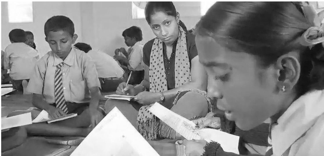
Listening, observing and assessing students learning English.

If you give your students plenty of ongoing opportunities to practise English, not just in the language lesson but at other times of the school day, you will have more opportunities to listen, observe and assess them. If students only hear or write English from the textbook lesson, their progress will be slower and you will have fewer opportunities to assess them. In the next activity you will extend the potential of your language textbook for students. This is also an opportunity for you to practise and extend your own use of English.